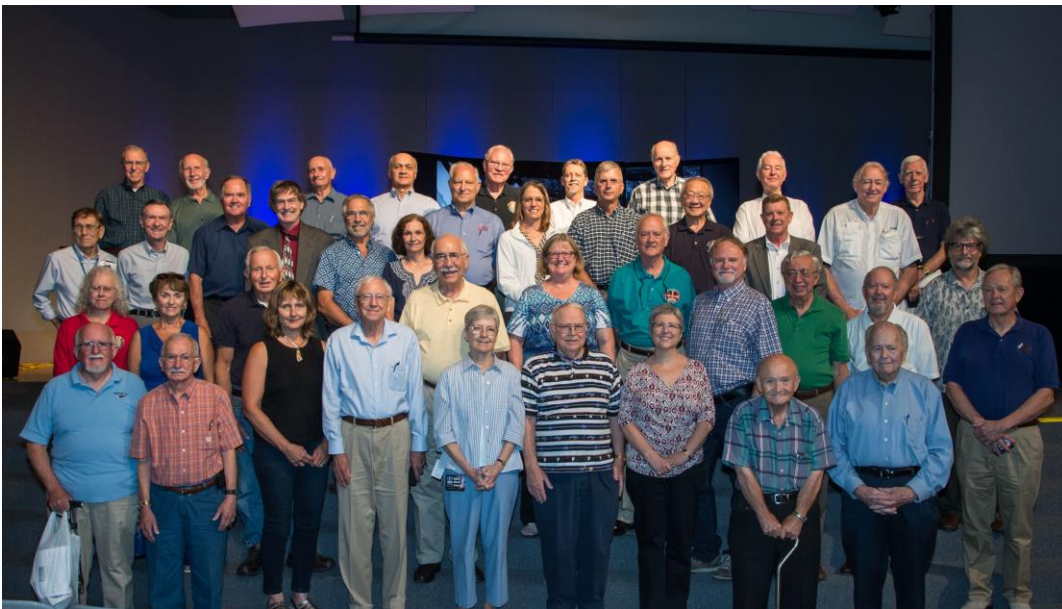
NAL Members at the STS 1 and 2 Lessons Learned Panel Discussion