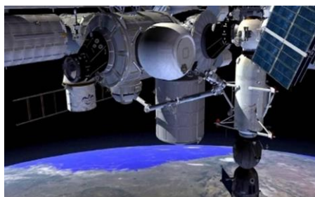
International Space Station