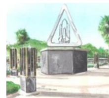
Memorials at Space Walk of Fame, Titusville, FL: from left to right, Mercury, Gemini, Apollo, and Shuttle

Space Walk of Fame Foundation in Titusville, FL has created a series of monuments memorializing the aerospace workers who contributed to the several NASA human space flight programs. Monuments now exist for Mercury, Gemini and Apollo, and work is underway on the Space Shuttle monument. You can have your named inscribed on the Shuttle monument (and on the monument for any of the earlier programs on which you worked) by sending your information and $100 per monument to the Space Walk of Fame Foundation. The address is: